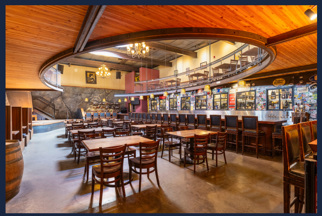
One-Of-A-Kind Must See Live/Work Building

Rare opportunity to acquire a standalone property in the heart of Fremont! Complete studs-out remodel in 2003. One must see to believe the attention to detail throughout -- this property doesn't disappoint. Incredible location just a stones throw to the Burke Gilman Trail and everything that Fremont has to offer. Located on the corner of Phinney Ave N & N. 35th St, the property has excellent visibility and signage opportunities. FF&E not included in the sale. Property will be delivered vacant at Closing.