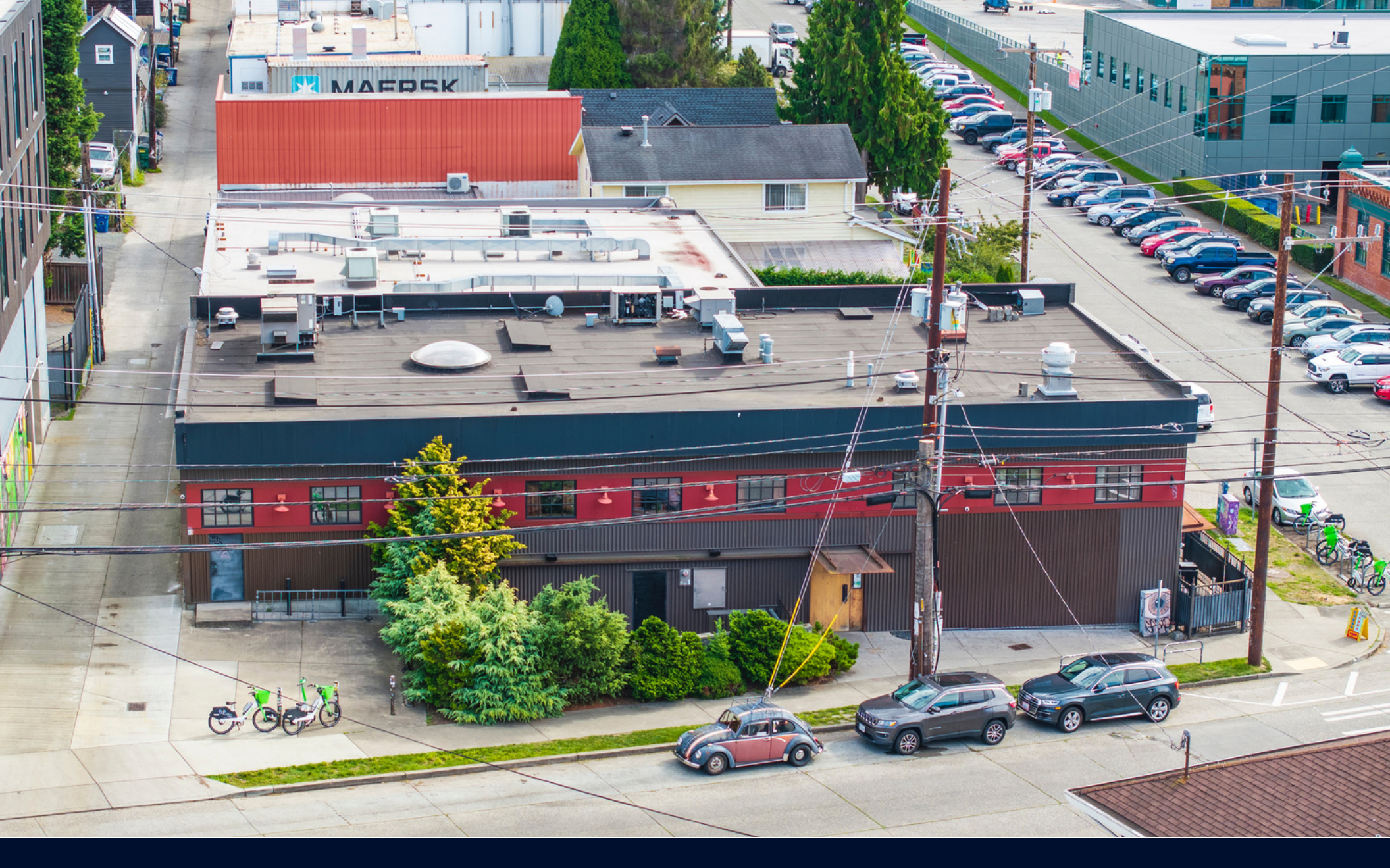
Brouwer's Pub Building for Sale in Fremont

400 N. 35th St, Seattle, WA 98103 $3,500,000