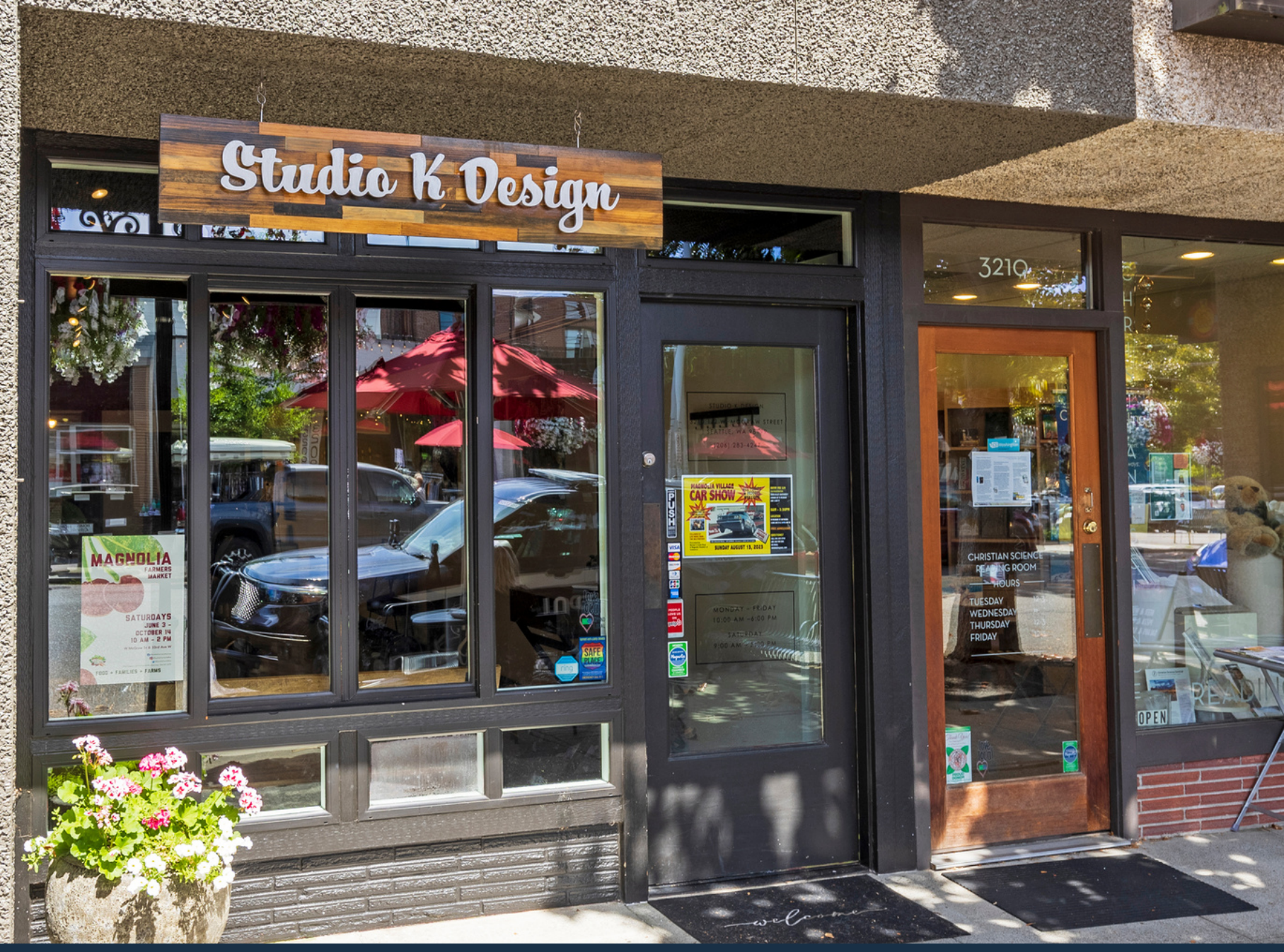
Approximately 672 SF Retail or Office Space for Lease in Magnolia Village 3210 1/2 W. McGraw St, Seattle, WA 98199 $2,572.80/Month + Utilities