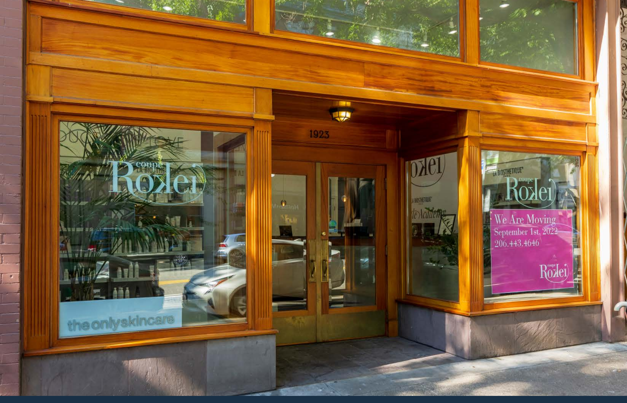
2,700 SF Retail or Office Space for Lease in Pike Place Market

1923 1st Avenue, Seattle, WA 98101 $35.00/SF/Year NNN