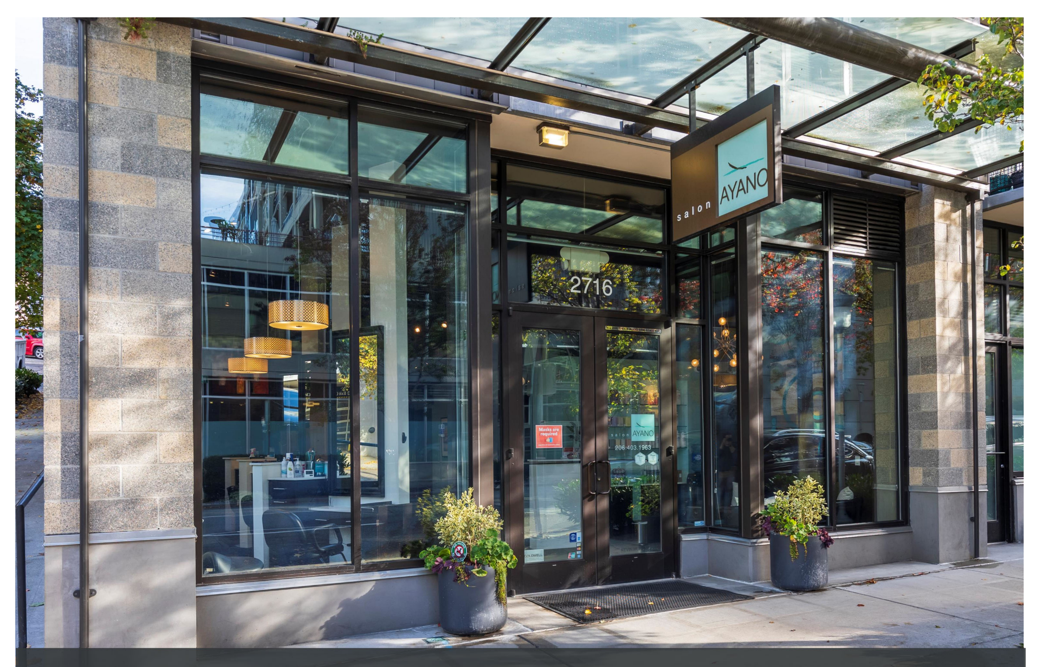
The Parc Commercial Condo For Sale 2716 Western Ave Seattle, WA 98121 $599,000